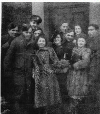
Outside 18, St Ignatius Sq. before the railings went for the war effort